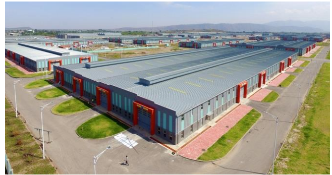
Hawassa Industrial Park located in the Southern Nations, Nationalities and Peoples Regional State

A total of seventeen IAIPs will be built across all states, and construction of four of them has already begun – in Bahker in Tigray, Bure in Amhara, Ziway in Oromiya and Yirgalem in SSNP. They will help attract more domestic and foreign investment.