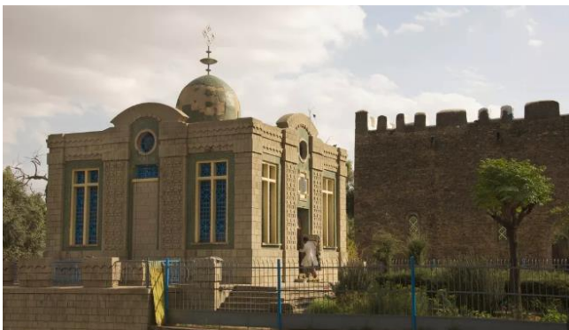
The Chapel of the Tablet in Aksum, Ethiopia claims to be the final resting place of the Ark of the Covenant.

Indiana Jones fans, did you know that the Ark of the Covenant is in Ethiopia?