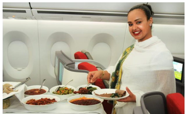
The national dishes on Ethiopian’s Cloud 9 menu will have you coming back for seconds... to Ethiopia.

Ethiopian Airlines Inflight Catering, the largest single in-flight catering facility in Africa, has won an award for “Outstanding Food Service by an African Carrier” during the 2017 PAX International Readership Awards in Hamburg.