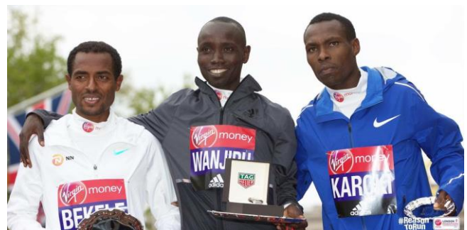
Bekele (left) with Kenya’s Daniel Wanjiru and Bedan Karoki.

A record 39,400 plus runners took part in the Virgin Money London Marathon on 23 rd April. In the men’s elite race, Kenya’s Daniel Wanjiru beat race-favourite Kenenisa Bekele in a thrilling finish to win his first London Marathon in 2:05:48. Kenenisa finished second in 2:05:57.