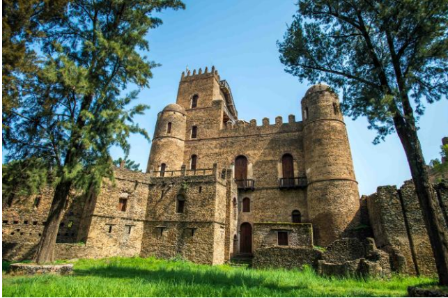
Gondar – the Camelot of Africa

the Library and Chancellery of Tzadich Yohannes; the Palace of Mentuab and the Banqueting Hall of the Emperor Bekaffa. Renowned monasteries, churches, thermal areas and the Palace of Guzara are also located in and around the city.