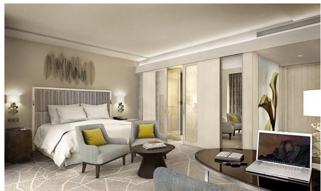
Standard room at Hyatt Regency Addis Ababa