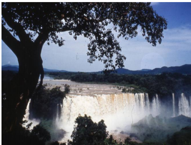
Tis Issat Falls on the Blue Nile

The commemoration also included an exhibition of equipment used on the expedition, including one of the original Avon white water boats.