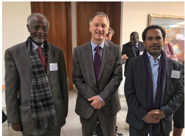
Ambassador Hailemichael (l) with the Scottish Minister for Trade, Investment & Innovation, Ivan McKee MSP and Amare Shumet

The programme included a range of sectors in which Scotland excels, and are considered priorities by many African Governments, such as renewable energy, education, oil and gas and agriculture.