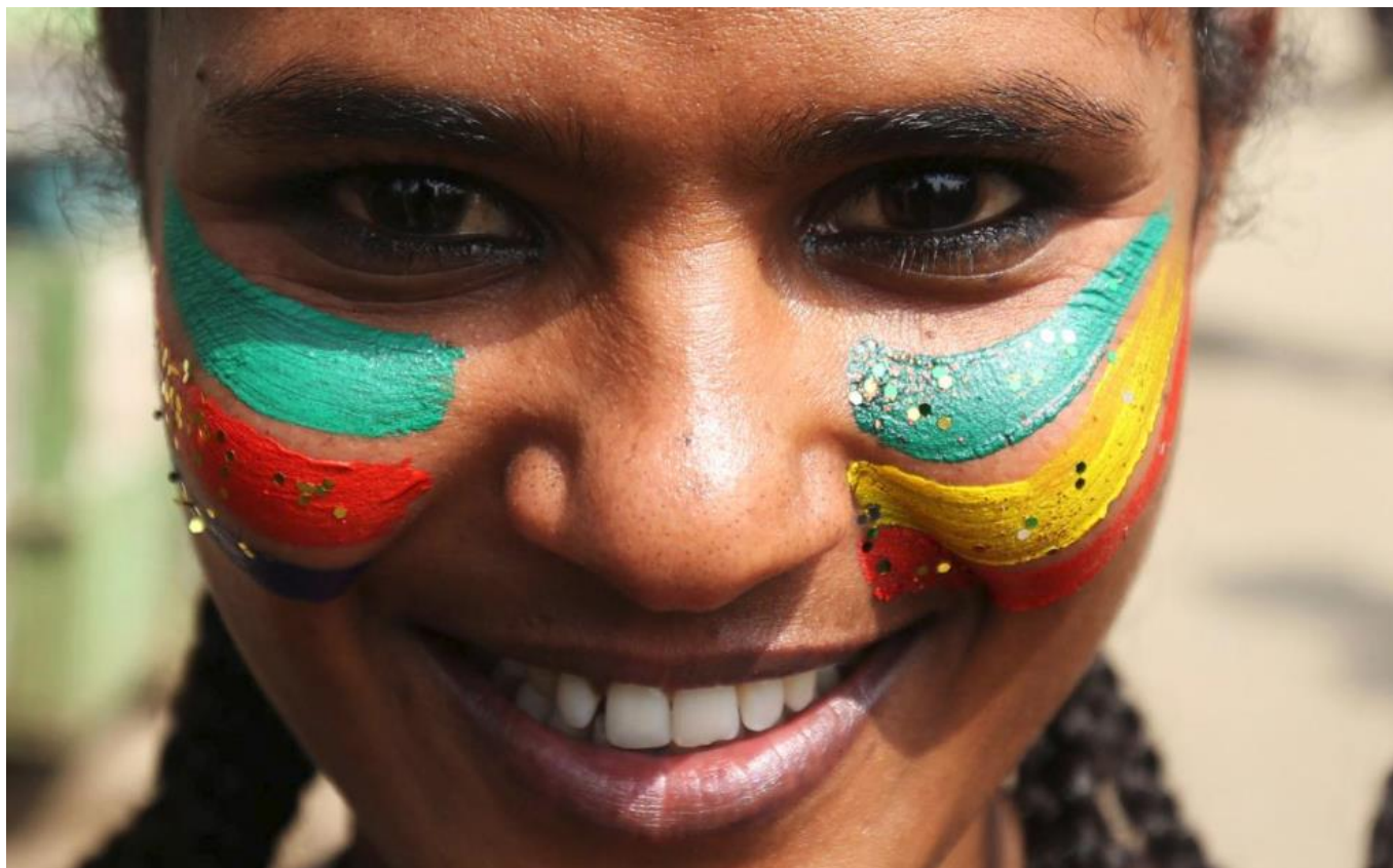
Photo: A woman with a face painting of Ethiopia and Eritrea flags, at a ceremony to welcome President Isaias Afewerki to Ethiopia, following the signing of the historic peace agreement that ended a 20-year state of war.

Ethiopia's New Year falls on 11 th September and this year - 2011 in the Ethiopian calendar - there was much to celebrate, as Ethiopians from across the country and from abroad, celebrated together in peace and unity.