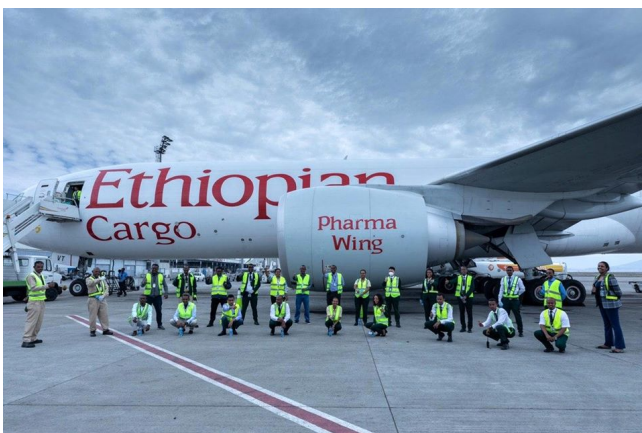
Ethiopian Airlines plays vital role in distribution of medical equipment across Africa

Last week, as part of a joint relief initiative for the African continent between Prime Minister Abiy and Chinese billionaire founder of Alibaba, Jack Ma, the Government of Ethiopia coordinated the successful distribution of millions of testing kits and personal protective equipment from China to African states.