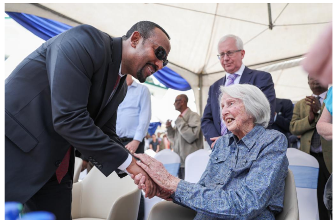
Prime Minister Abiy with Dr Hamlin in 2019

In 2012, the Ethiopian Government awarded Catherine an Honorary Ethiopian Citizenship and in 2019 Prime Minister Abiy Ahmed presented her with the Eminent Citizen Award in recognition of her lifetime of service to the women of Ethiopia. She was also twice nominated for the Nobel Peace Prize, and received numerous awards.