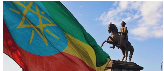
Statue of Emperor Menelik II, who led Ethiopia to victory in 1896

The historic victory of the Battle of Adwa, that took place in 1896 against invading Italian forces, made Ethiopia the only country in Africa never to be colonised.