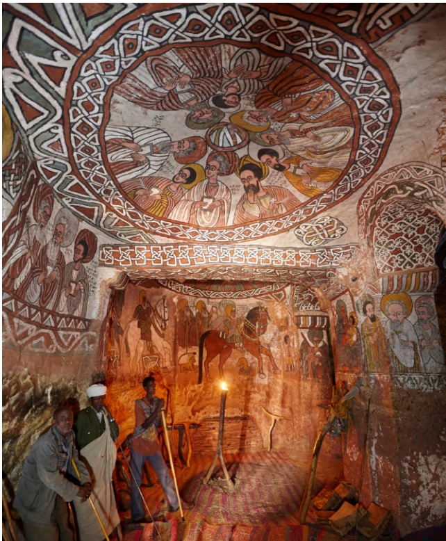
Priests and deacons inside Abuna Yemata Guh church

“If your time in the country is limited, the Gheralta Mountains are a good shout: only half a day’s travel from the capital (via plane and public bus or 4WD), not touristy, with plenty of hiking, rock climbing, history and churches.”