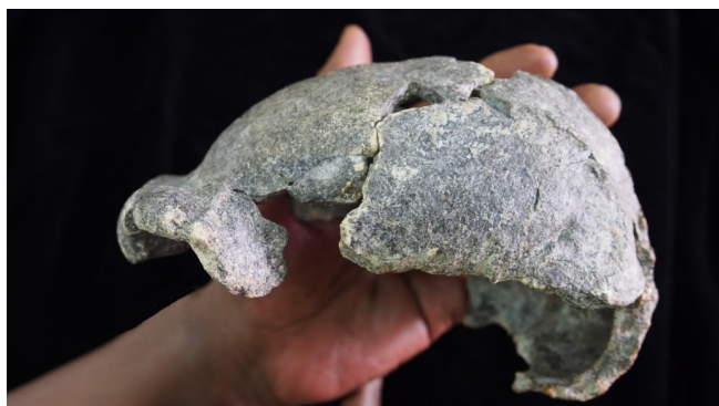
The DAN5 cranium.

An international research team led by scientists from the U.S. and Spain, has discovered a nearly complete cranium of an early human ancestor, estimated to date from about 1.5 million years ago, and a partial cranium dated to about 1.26 million years ago, from the Gona study area in Ethiopia's Afar State.