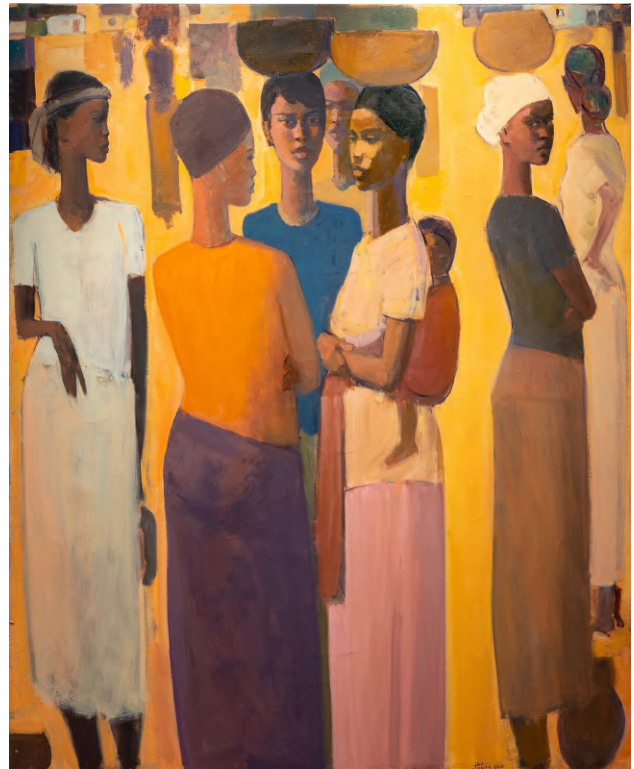
Pillars of Life: Saturday Market VI (2020)