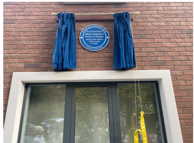
The plaque was unveiled to the tune of the Ethiopian National Anthem.