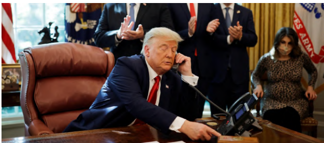
U.S. President Donald Trump speaks on the phone with leaders of Israel and Sudan in the Oval Office

During a televised announcement confirming that Sudan and Israel had normalised relations on 23 rd October, President Trump suggested that "They'll [Egypt] blow up that dam [Grand Ethiopian Renaissance Dam], and they have to do something...They should have stopped it long before it was started."