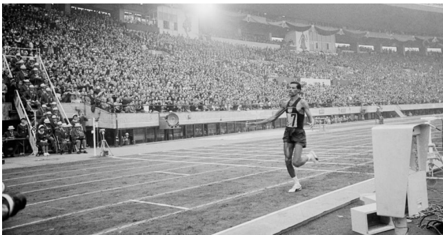
Abebe Bikila breaks the tape as he crosses the finishing line to win the Men's Marathon race on 21 October 1964 during the Olympic Games at the National Stadium in Kasumigaoka, Shinjuku, Tokyo, Japan.

In October 1964, Tokyo hosted their first Olympic Games. To celebrate, Tokyo 2020 is highlighting some of the most incredible and historic moments that took place 56 years ago, among them is Abebe Bikila, the Ethiopian marathon runner who glided through the streets to claim gold.