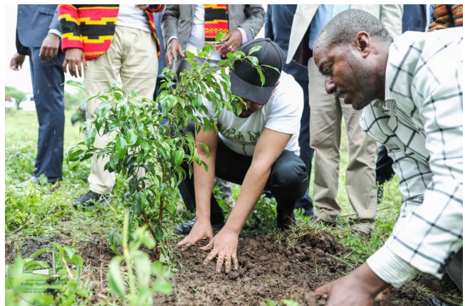
Prime Minister Abiy plants a tree in Southern Nations, Nationalities and People's Regional State, Ethiopia

In addition to ordinary Ethiopians, the diplomatic corps, various international organisations, and the business community also joined in the tree-planting campaign. Public offices and schools were closed in order to allow maximum participation.