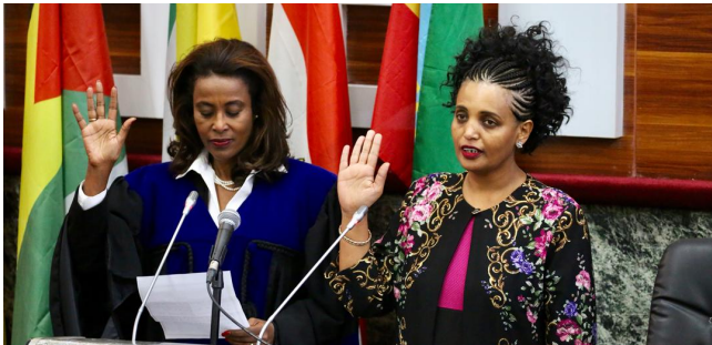
Birtukan Mideksa (right) is sworn in as chairperson of NEBE in November 2018

On the technical side, former opposition leader and outspoken critic, Birtukan Mideksa, now heading up the NEBE, following her appointment by Prime Minister Abiy Ahmed, commands the highest esteem from Ethiopian society and will be trusted to ensure that the election process is fully free and fair.