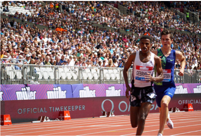
Hagos Gebrhiwet winning the men’s 5,000m

On Day 1 at the men’s 5000m, three-time global 5k-medalist Hagos Gebrhiwet, held off Norway’s 18-year-old Jakob Ingebrigtsen, winning in 13:01.86.