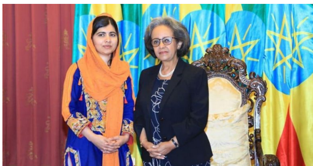
Malala with President Sahle-Work

Malala Yousafzai, a UK-based Pakistani activist for female education, visited Ethiopia in July where she met with various government officials including Prime Minister Abiy, President Sahle-Work and young Ethiopian activists to learn more about Ethiopia's progress on education and equality, as well as the challenges and the changes they wish to see for their country.