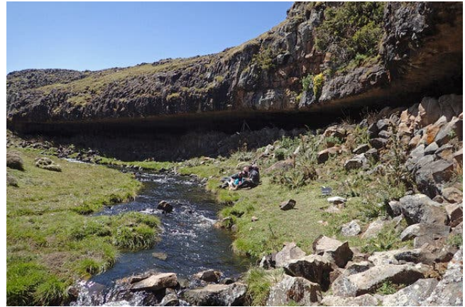
The Fincha Habera rock shelter in the Bale Mountains where numerous signs of human settlement were found

Scientists have discovered what is said to be the first evidence of human presence high in Ethiopia’s Bale Mountains, dating as far back as 45,000 years ago.