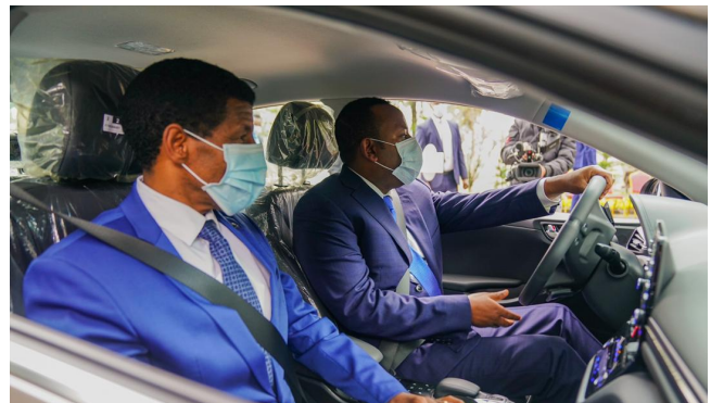
Prime Minister Abiy is accompanied by Haile Gebrselassie on a test drive

Ethiopia's distance running legend, Haile Gebrselassie, presented the car to the Prime Minister. Marathon Motors is a joint venture between South Korea's Hyundai Motor Company and Haile Gebrselassie.