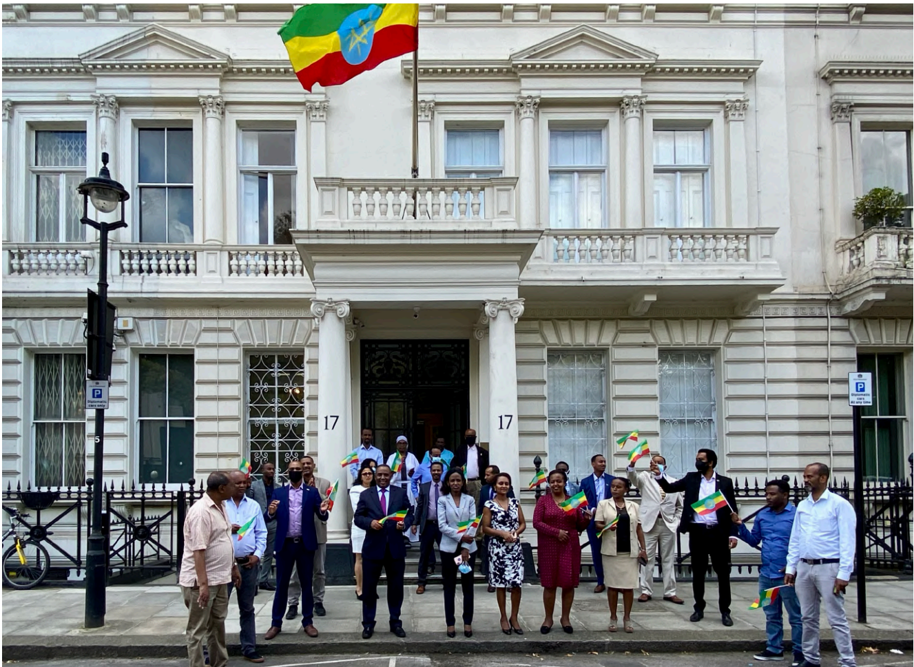
Diplomats and Staff celebrate the first filling of the GERD at the Embassy on 3 August 2020

Urging them to stand together for Ethiopia's principled stand over the construction of the Dam, he added "I look forward to seeing the final conclusion of the GERD, which will benefit millions of Ethiopians and people in the wider region."