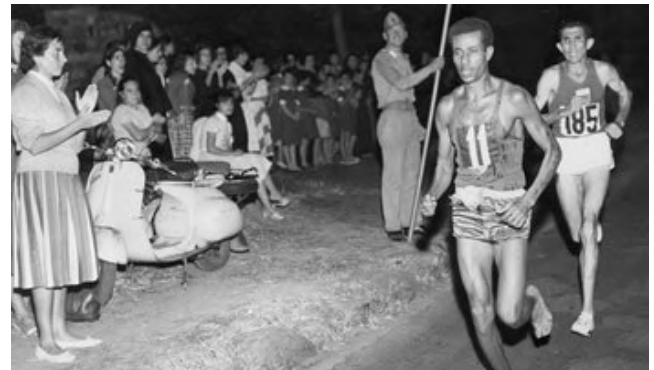
Abebe Bikila running during the 1960 Olympic marathon.

"I wanted the world to know that my country, Ethiopia, has always won with determination and heroism."