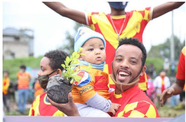
Addis Ababa residents planting seedlings on 2 nd August

Despite the global pandemic, Ethiopia is committed to meeting its target. National efforts will mobilise planting at household and community level, adhering to social distancing and other COVID-19 preventive measures.