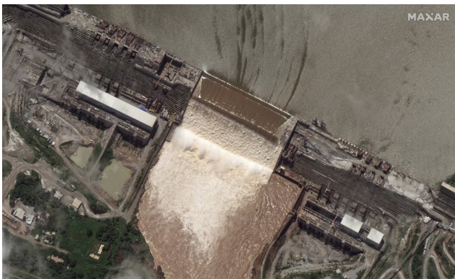
This satellite image shows the Grand Ethiopian Renaissance Dam on 28 th July.

The news was announced on 19 th July and brought joy and a great sense of satisfaction to Ethiopians, from rich to relatively poor, most of whom had contributed to the construction of the Dam, according to their means, by investing in Bonds. Senior government officials congratulated the public on their invaluable contribution and spoke of the transformative nature of the GERD.