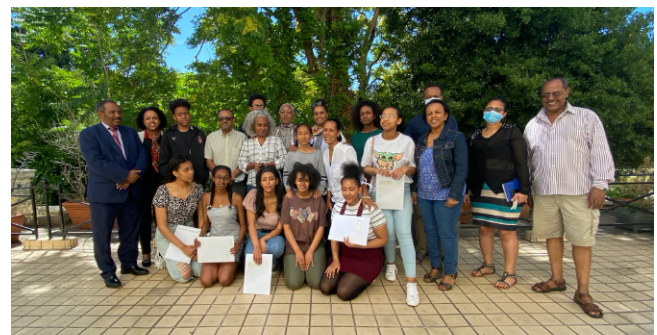
Ethiopian diaspora visit the Embassy in support of the GERD

Heeding the call, Ethiopians in the UK and abroad took part in the campaign, which saw thousands posting social media content and videos of themselves in support of the GERD and encouraging others to continue with their support to see the completion of the dam.