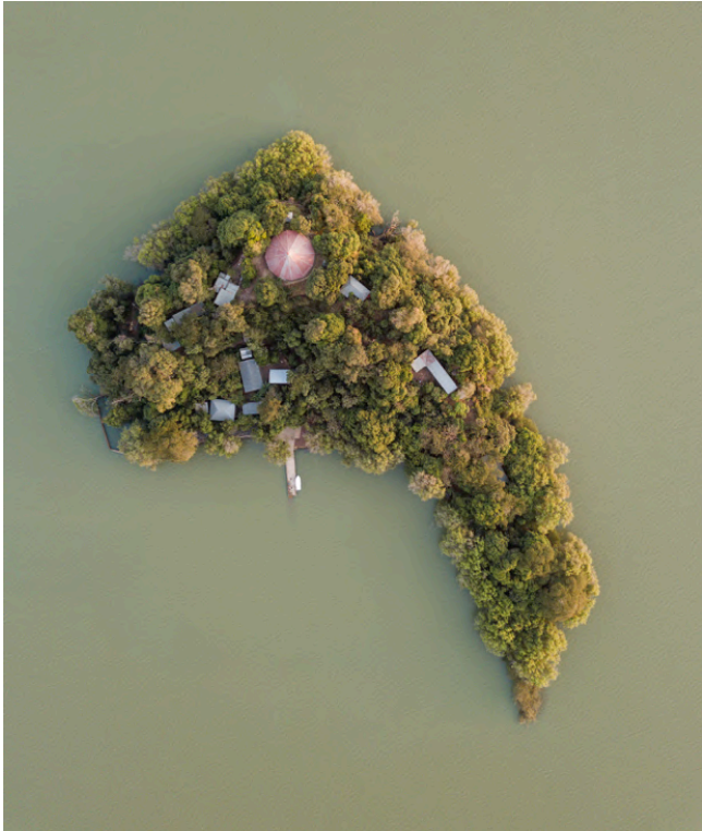
Entos Eyesus church forest on an island in Lake Tana near Bahir Dar