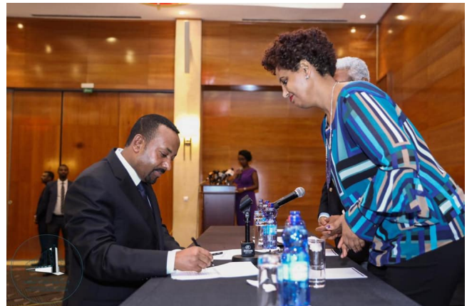
PM Abiy signs the pact as the chair of the National Election Board, Birtukan Mideksa, looks on

In the run-up to Ethiopian Elections slated for 2020, more than 100 competing political parties have signed a code of conduct agreement as part of efforts to open up the political space and the government's commitment to ensuring free, fair and inclusive elections.