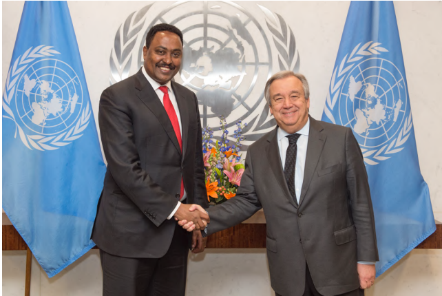
Secretary-General António Guterres with Workneh Gebeyehu (File Photo)

Dr Workneh has served as Ethiopia's Foreign Minister since 2016.