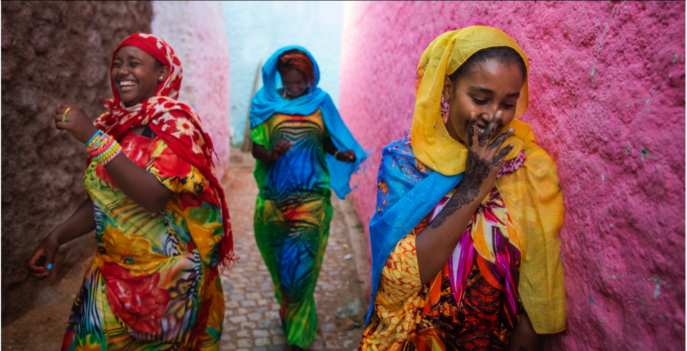
Muslim girls in the colourful historic city of Harar