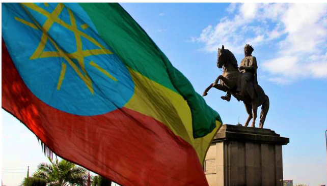
Statue of Emperor Menelik II in Addis Ababa

Ethiopians, under the command of Emperor Menelik II, defeated over 20,000 well-armed Italian colonial forces. The pivotal victory of the Battle of Adwa made Ethiopia the only country in Africa never to be colonised.