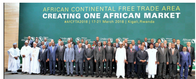
The African Heads of States and Governments pose during AU Summit for the agreement to establish the African Continental Free Trade Area in Rwanda, in March 2018.

The Agreement was launched last March in Kigali, Rwanda, during the African Union Summit, where it was signed by 44 countries. Since then, eight more have signed and on 2 nd April Gambia became the 22 nd nation to ratify, meaning the historic agreement can now come into force.