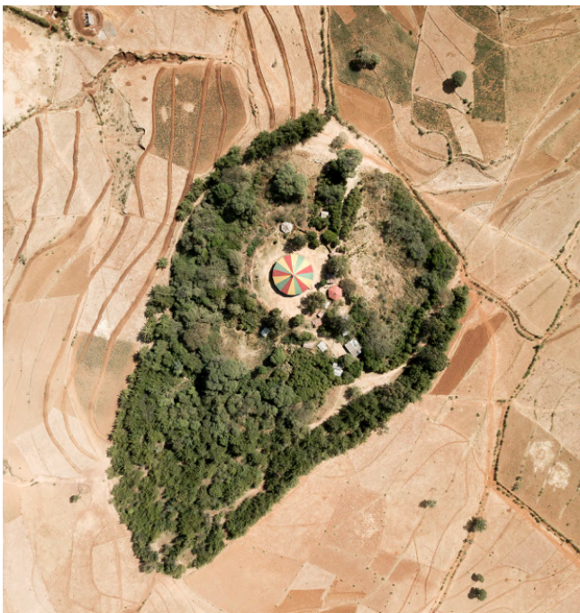
The Debre Mihret Arbiatu Ensesa church, which looks from above like a bright pinwheel, is surrounded by trees.