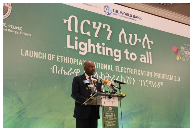
Ethiopia's Minister of Water, Irrigation and Electricity, H.E. Dr. Seleshi Bekele

The updated version of Ethiopia's National Electrification Programme (NEP 2.0) was launched on 27 th March during the 'Africa Energy Forum: Off the Grid' and 'Regional Energy Co-operation Summit'.