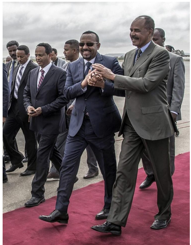
PM Abiy is received by President Isaias Afewerki in Asmara

Expressing his gratitude for the PM's olive branch, President Isaias Afewerki reciprocated, reiterating that Ethiopia and Eritrea share lots of commonalities that run the gamut from culture and languages to politics and the economy.