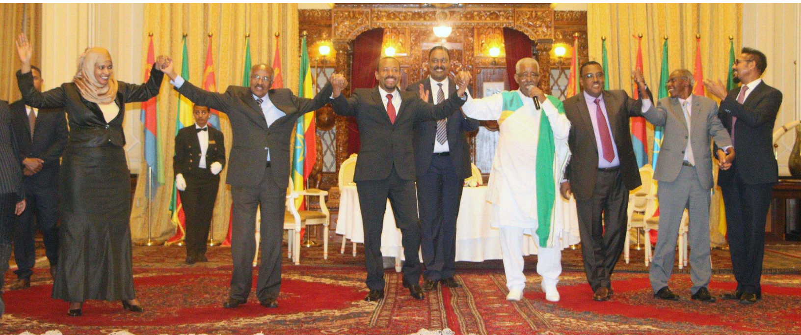
Photo: PM Abiy with Eritrean High-Level Delegation, led by Foreign Minister Osman Sale Mohammed (second left) in Addis Ababa (June 2018)

The 9 th July 2018 will go down history as the day Ethiopia and Eritrea declared an end to the state of war that existed between the two nations.