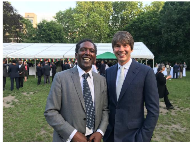
Celebrity guests included TV space scientist Professor Brian Cox and Ethiopian-born British Poet Lemn Sissay.