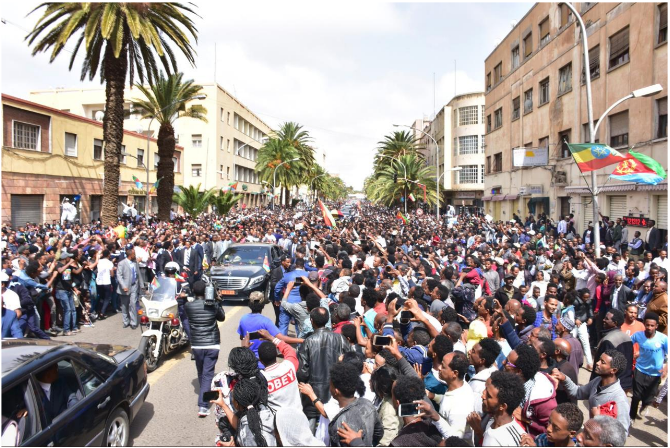
Scores of Eritreans flock the street to greet PM Abiy and his delegation