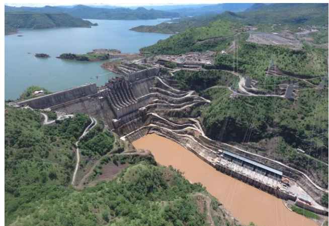
Gibe III Hydropower plant, inaugurated in December 2016, is the tallest RCC dam in the world with an installed capacity of 1,870 MW

With a hydropower potential of 45,000mw, Ethiopia has one of the largest resources on the African continent. Since 2011, the country has been boosting the development of renewable energies and aims to be the energy hub for East Africa in the medium term.