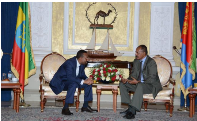
PM Abiy in talks with President Isaias

In unimaginable scenes, thousands of Eritreans lined the streets of Asmara in song and dance, cheering to welcome PM Abiy and his delegation.