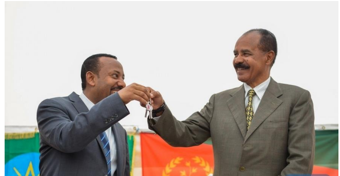
PM Abiy hands over the keys of the Eritrean Embassy to President Isaias

To mark the conclusion of the three-day visit, the Eritrean Embassy in Addis Ababa was reopened on 16 th July by Eritrean President Isaias Afewerki, in the presence of Prime Minister Dr Abiy Ahmed and other senior government officials.