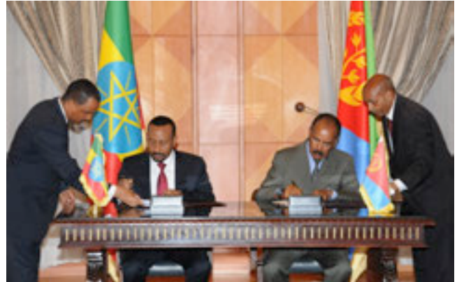
PM Abiy and President Isaias sign the historic Joint Declaration of Peace and Friendship between Ethiopia and Eritrea

Road and air transport, and telecommunication links were restored between Ethiopia and Eritrea after 20 years, and Eritrea has expressed its readiness to allow Ethiopia access to the Port of Assab.