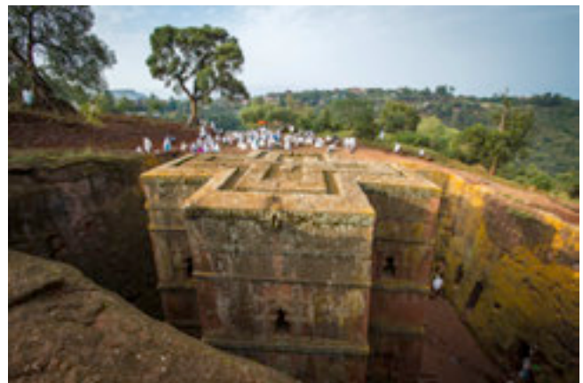
Ethiopia's historic city of Lalibela

Saving the best for last, the final leg of the trip saw the group in Lalibela, home to eleven rock-hewn churches dubbed the 'New Jerusalem'. Excavated by King Lalibela in the 12 th century and still in active use today, Lalibela has been dubbed the "Eighth Wonder of the World" and represents an Ethiopian church-excavating tradition that dates to the arrival of Christianity circa 350 AD.