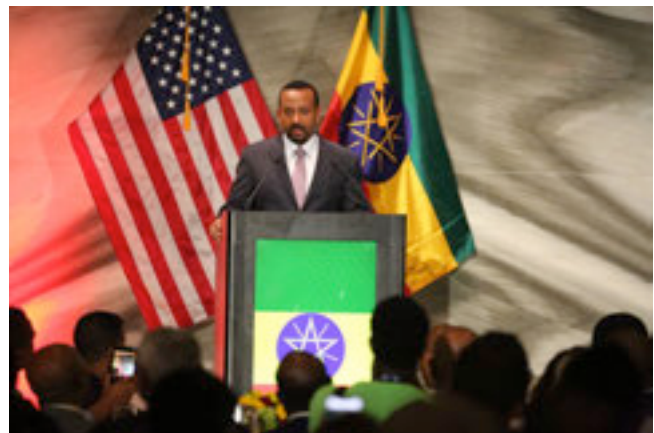
PM Abiy holds discussions with leaders of US-based Ethiopian political parties in Washington DC

Next in Prime Minister Abiy's speaking itinerary was the United States of America – home to the largest Ethiopian diaspora – where he borrowed one of former-President John F. Kennedy's phraseologies: "Ask not what your country can do for you, but what you can do for your country!" to encourage thousands of Ethiopians in Washington DC, Los Angeles and Minneapolis to be part of Ethiopia's revival.