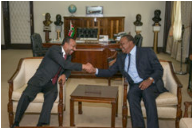
PM Abiy with Kenyan President, Uhuru Kenyatta

Kenya, Djibouti, Egypt and Somalia, where he apprised the leaders of the smooth transition of power which had taken place in Ethiopia as well as his administration's commitment to further enhance bilateral and regional relations. At Uganda's National Heroes Day on 9 th June, President Yoweri Museveni made Prime Minister Abiy a Member of "The Most Excellent Order of the Pearl of Africa."