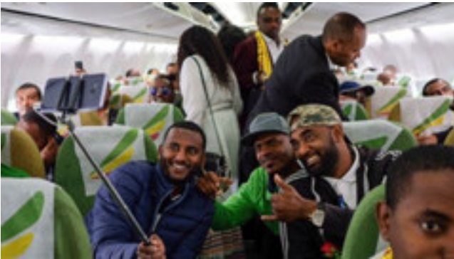
Passengers pose for a selfie onboard a flight from Addis Ababa to Asmara

Passengers on board the historic flight were in high spirits singing and dancing in the aisles. Flight attendants also handed out roses to all passengers and served champagne.