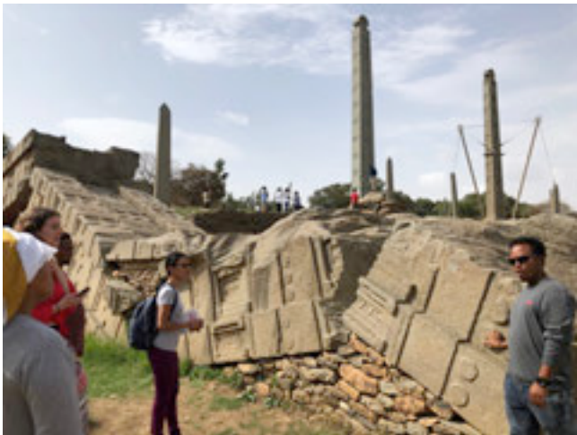
Aksum Stelae Park

In Aksum, the oldest continuously-inhabited city in sub-Saharan Africa, a guided tour of the Aksum Stelae Park, St. Mary Tsion Cathedral (Ethiopia's oldest church) and Chapel of the Tablet (home to Biblical Ark of the Covenant), was followed by a visit to the ruins of the Queen of Sheba Palace.