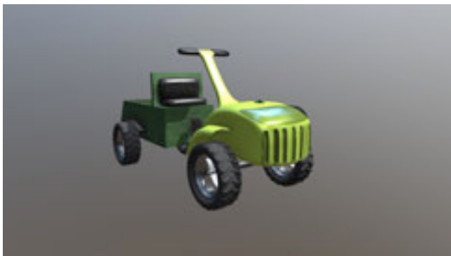
Prototype Transport for Enpov

The team visited Ethiopia in November and December 2017 where they met more than 20 farmers and with regional bureaux as part of their field research for the project. Touched by the story of one farmer in the Oromia Region who had to walk for hours to get his crops to the market, the team decided to make a difference by bringing hybrid transportation to scale.