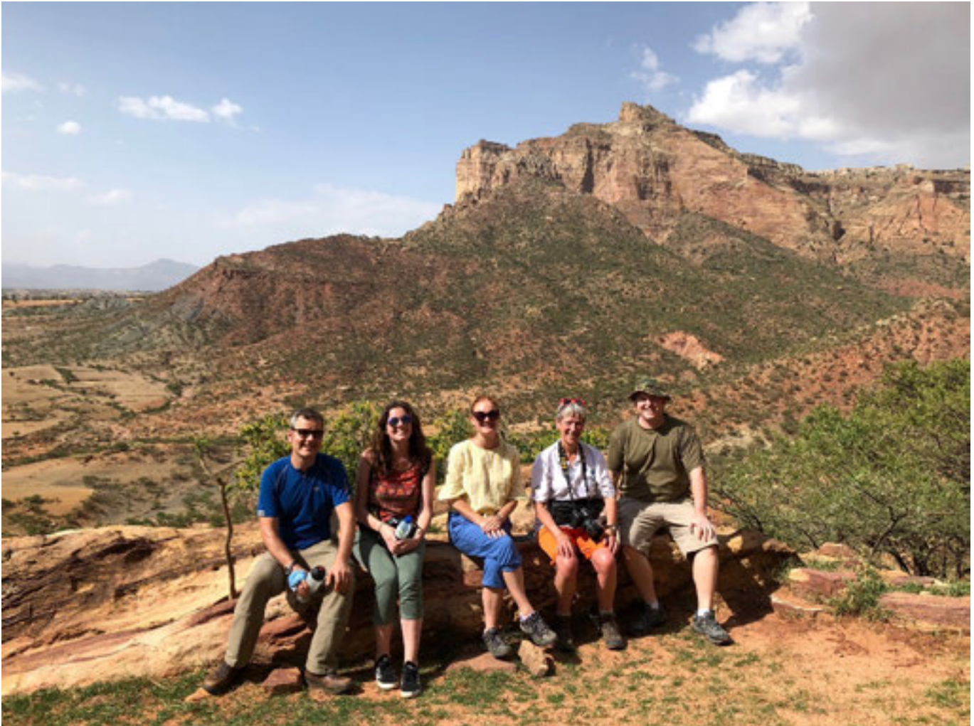
Part of the group at Gheralta Mountains

Ethiopia hosted a group of journalists, bloggers, travel writers and tour operators who visited Ethiopia as part of a FAM (familiarisation) trip organised by Ethiopian Airlines, the Ethiopian Tourism Organisation and the Embassy.